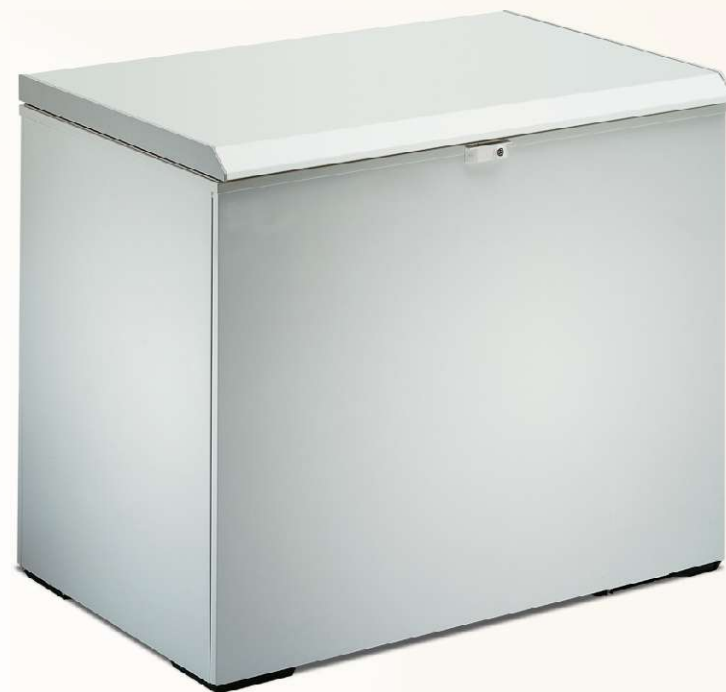
F 38 Chest Freezer