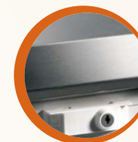
STAINLESS STEEL LID AVAILABLE*